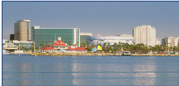
Long Beach, California, site of the 2009 Biennial National Conference.