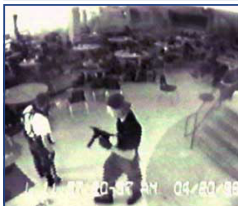
The first officers on the scene had never trained for what they found at Columbine High School. No hostages. No demands. Just killing. Columbine has transformed the way law enforcement deals with active shooter situations.